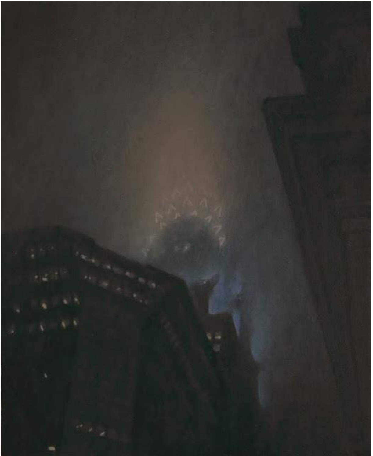
A Walk in the Rain