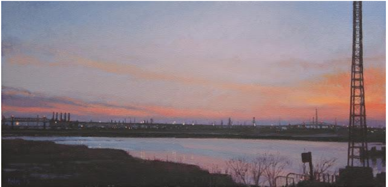
Newark at Dusk