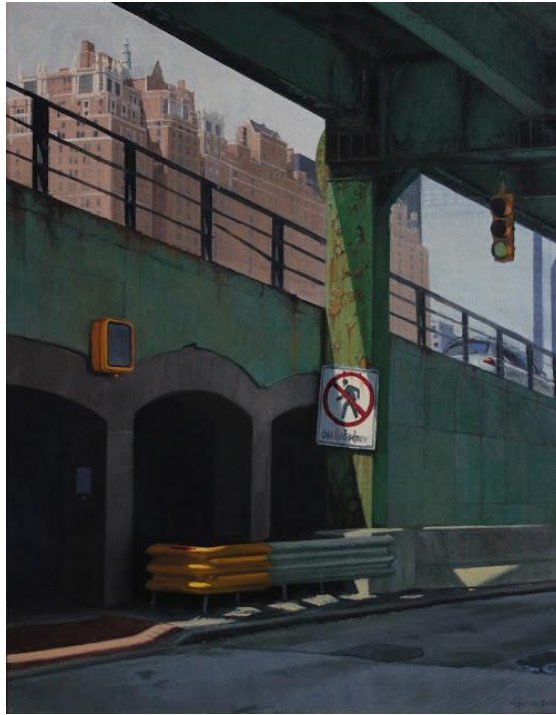
Under the FDR