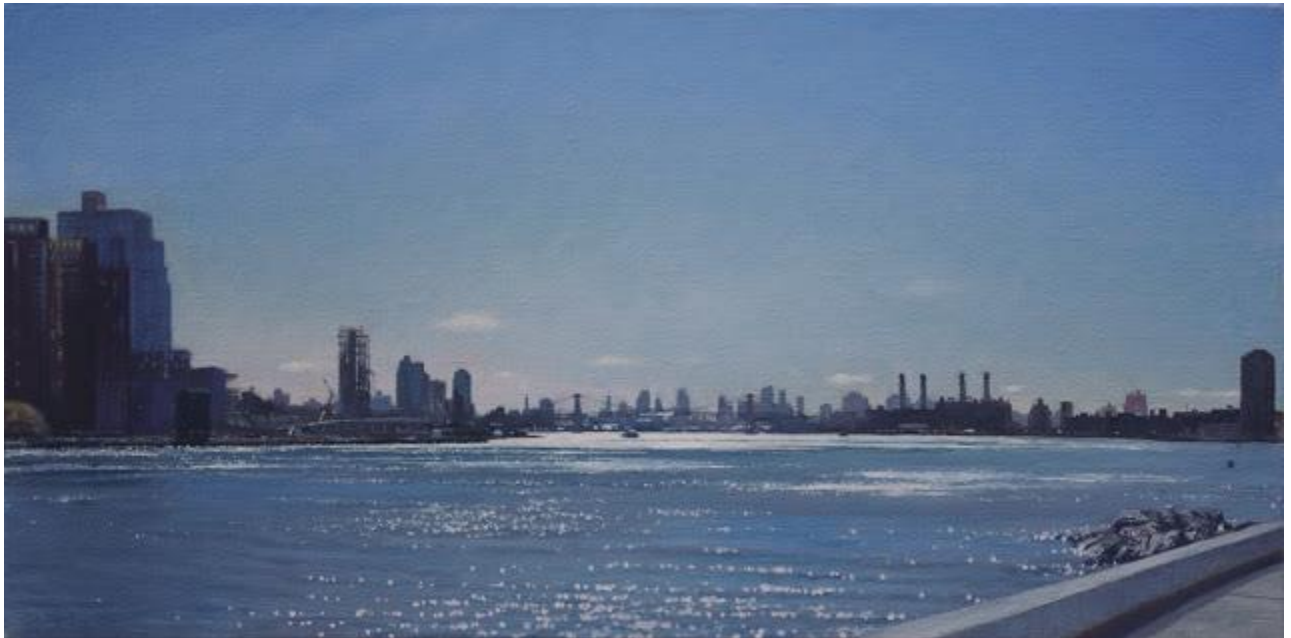
Down the East River